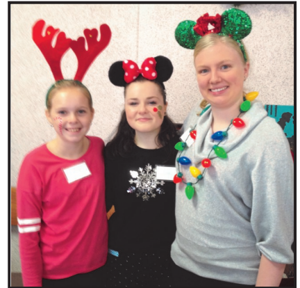
Our Faith Formation program is an important part of our growing parish!

The addition of Bible Study and Book Clubs for adults throughout the year has helped to remind us that we are life-long learners of faith!