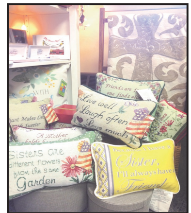
Our Welcome Center and Parish Store has 8 wonderful volunteers who ensure everyone feels at home here at St. Johns!

Our Prayer Shawl Ministry comes together weekly to lovingly knit shawls for those needing comfort, as well as baby blankets to be given as baptism gifts.